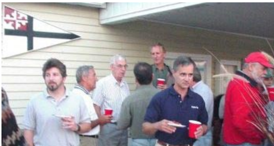
The real Trophies are the food and drink

... Trophy Party