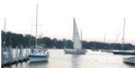
Who's that sailing in ??